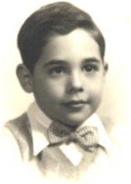
Portrait of the author (circa 1949) as a young boy (pre-author days)