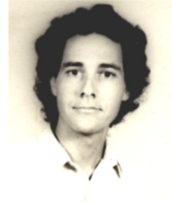
Portraits of the author (1979-1980) while writing The Far Shore (1st edition)